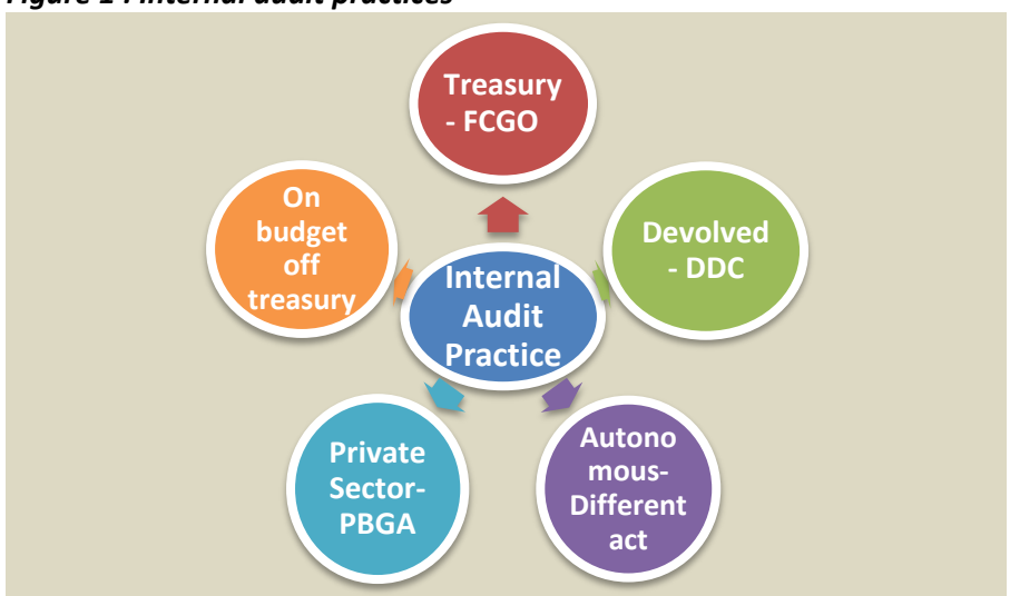
Figure 1: Internal audit practices

MoH funds that are channelled through the district development committees have different provisions for the internal audit. The internal audit section of the district development committees and municipalities are responsible for auditing of funds that go through their accounts. Offices incorporated under the Development Board Act, by government order, or under special charter, have a hybrid system of internal audit. Finally, MoH also provides funds to the private sector and the internal audit practices in direct and private funding are not harmonised into one standard system. The FPR requires that the internal audit shall be conducted for revenue, deposit, income and expenditure, of allocation or other public funds in spending units established in accordance with the prevailing law. Internal audit is performed to ascertain whether the financial resources are used in an economical, efficient and effective manner; if the goal, as per the approved annual program, has been achieved; and whether the internal control is effective. The DTCOs report to respective expenditure units and are responsible for clearing irregularities and implementing the recommendations in its report.