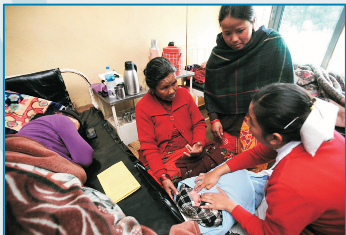
A nurse showing a mother how to care for her baby

Concerned government agencies: Family Health Division, Mid-Western Regional Health Directorate and Banke DPHO