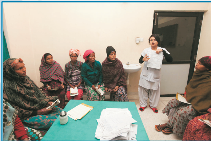
Group education had a greater impact than individual counselling

One solution adopted in the participating hospital to overcome the workload challenge was to provide group rather than individual counselling. Group sessions on PNC were provided to 41% of women delivering at Bheri Zonal Hospital during the evaluated period. The women who received information in a group prior to discharge had greater recall of the advice and danger signs than individually counselled women.