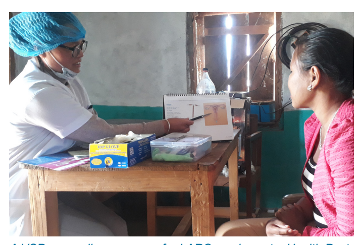
A VSP counseling a woman for LARC services at a Health Post

In low-resource settings such as Nepal, where very few family planning (FP) service providers have received competency-based training on LARC; and when those trained are mostly based at hospitals and in urban areas, the VSP model has immense potential to improve LARCs uptake. VSPs, as the name suggests, are trained providers who visit primary level health facilities as per planned schedules to deliver LARC services.