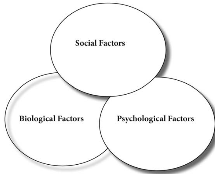
Figure 1. Bio-psycho-social Model

Trainer should discuss with participants how bio-psycho-social factors are interrelated. Participants are asked to give examples of how a problem in one domain leads to problems or complaints in another domain.