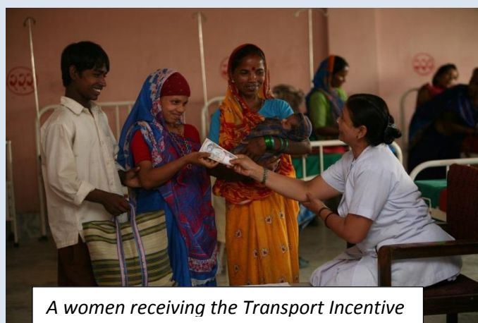
A women receiving the Transport Incentive

The Aama Programme was introduced to reduce financial barriers to women seeking institutional delivery. It aims to increase the number of institutional deliveries and thereby reduce maternal morbidity and mortality. The Aama Programme has evolved and matured over the years.