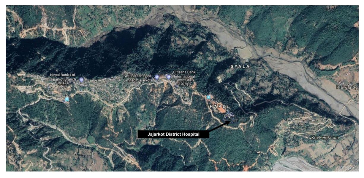
Figure 1: Jajarkot District Hospital location.

Jajarkot District Hospital is located in Khalanga, Bheri Nagarpalika, Jajarkot (see Figure 1) Originally a 15-bed hospital, it has been subsequently upgraded to accommodate 50 beds. The hospital site contains 36 building blocks. In line with national policy, it is planned to bring the hospital up to Primary A3 Hospital level of service.